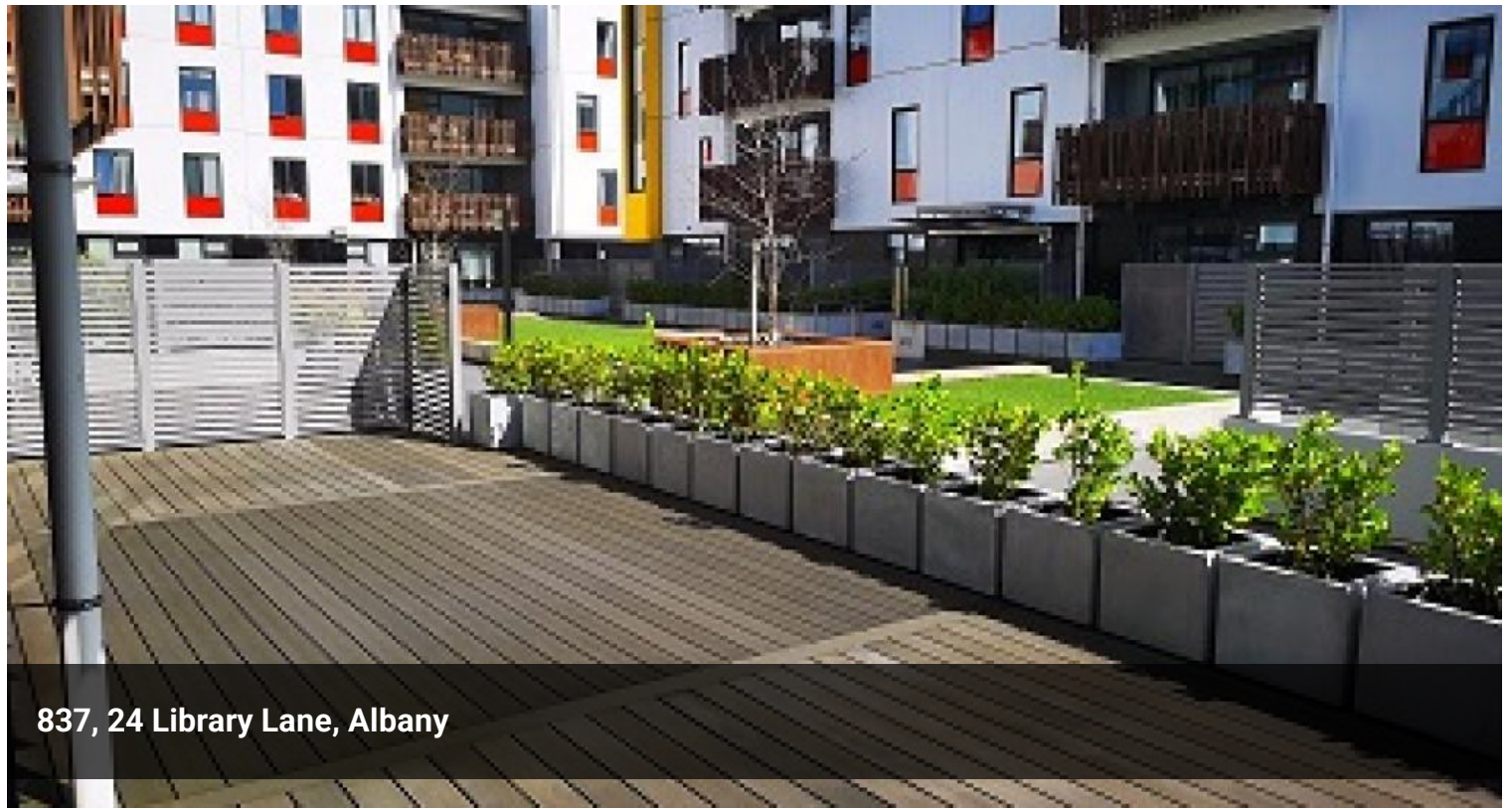
837, 24 Library Lane, Albany