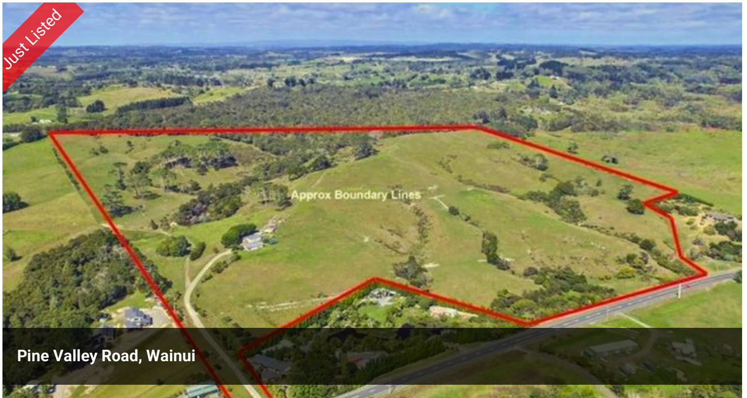
Pine Valley Road, Wainui