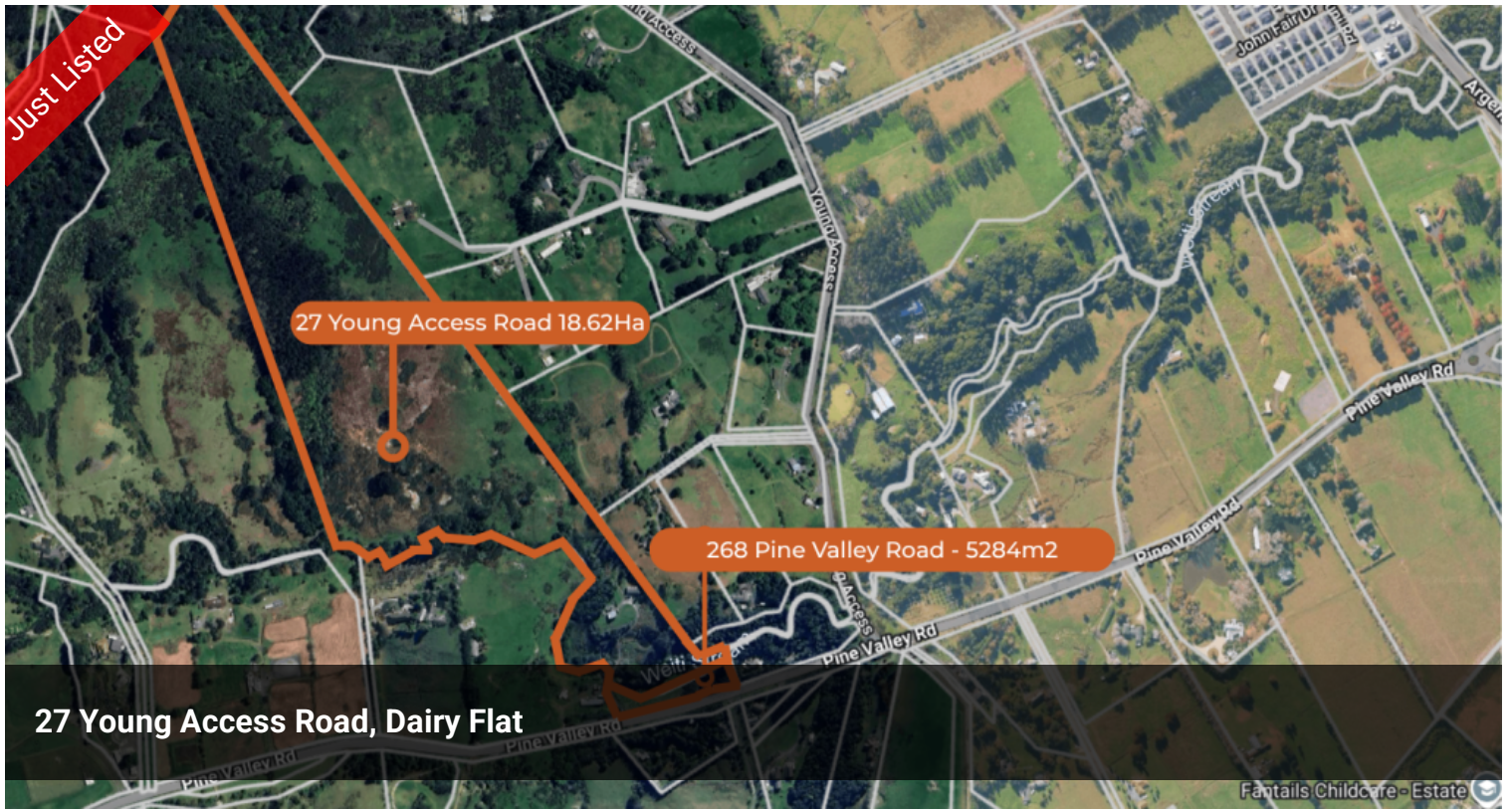
27 Young Access Road, Dairy Flat