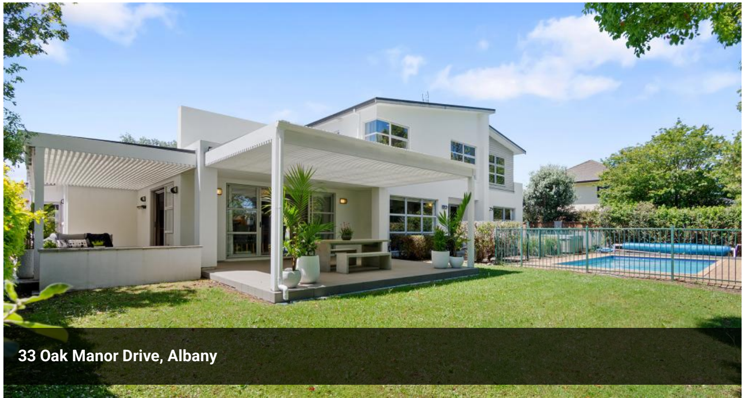
33 Oak Manor Drive, Albany