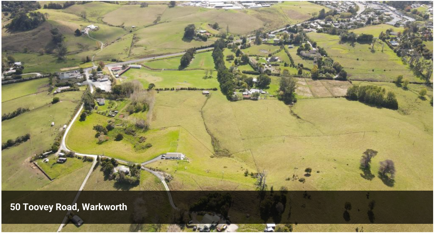
50 Toovey Road, Warkworth