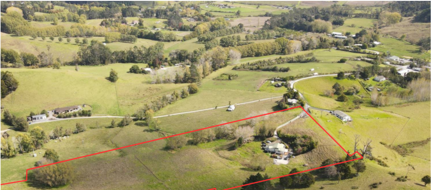
50 Toovey Road, Warkworth