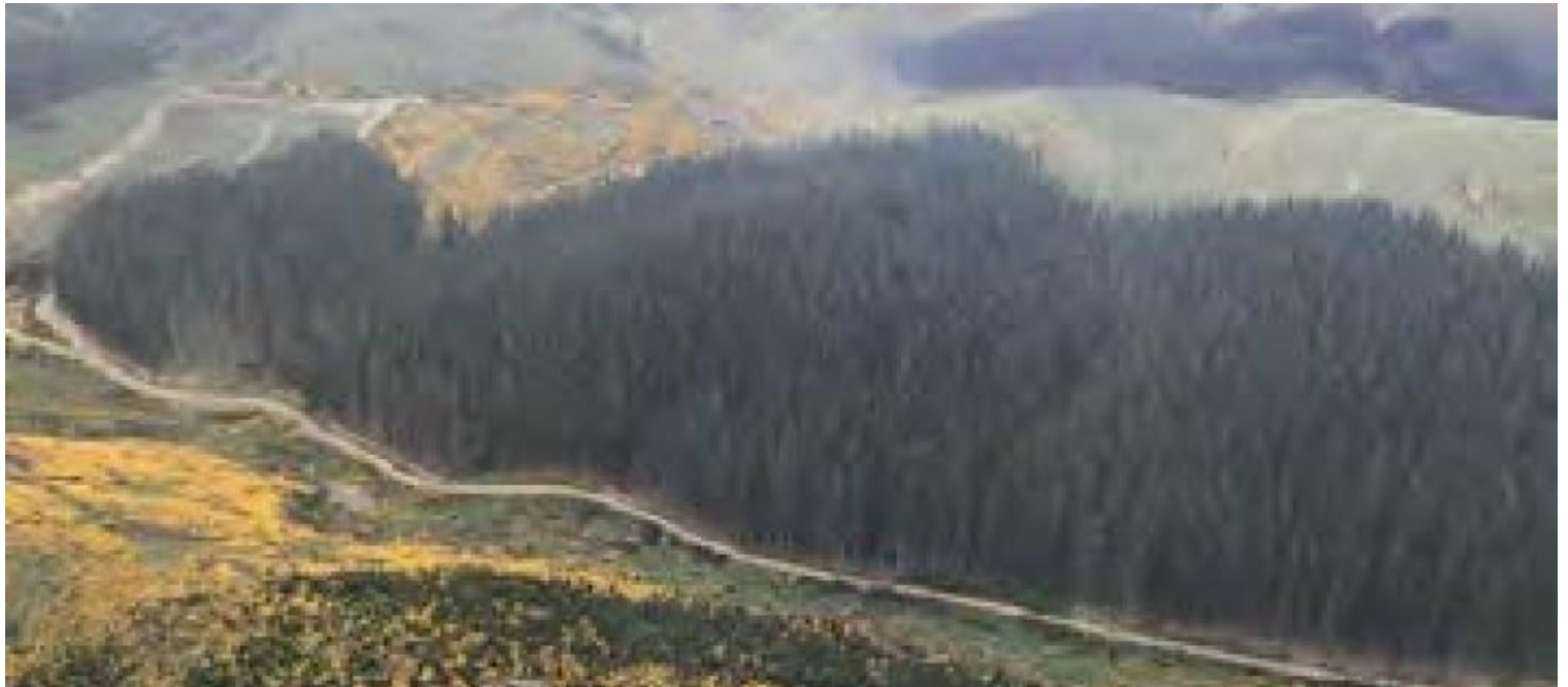
Switchback Road, Glenpark