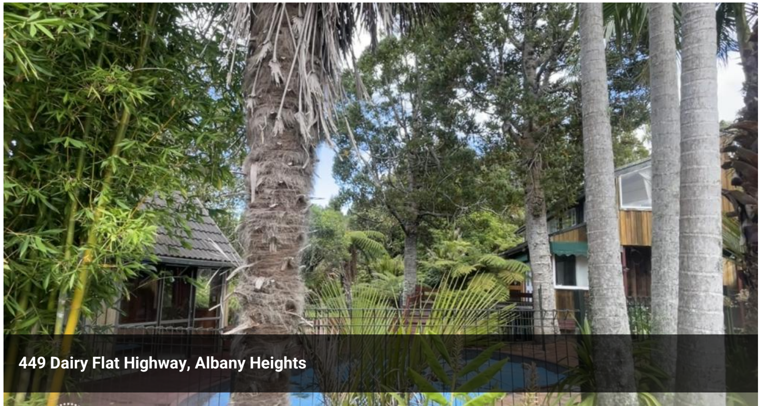
449 Dairy Flat Highway, Albany Heights