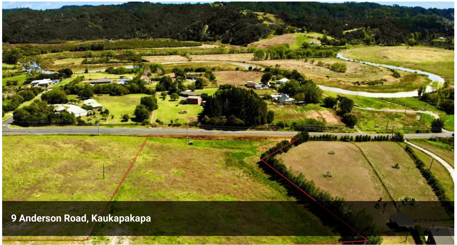
9 Anderson Road, Kaukapakapa