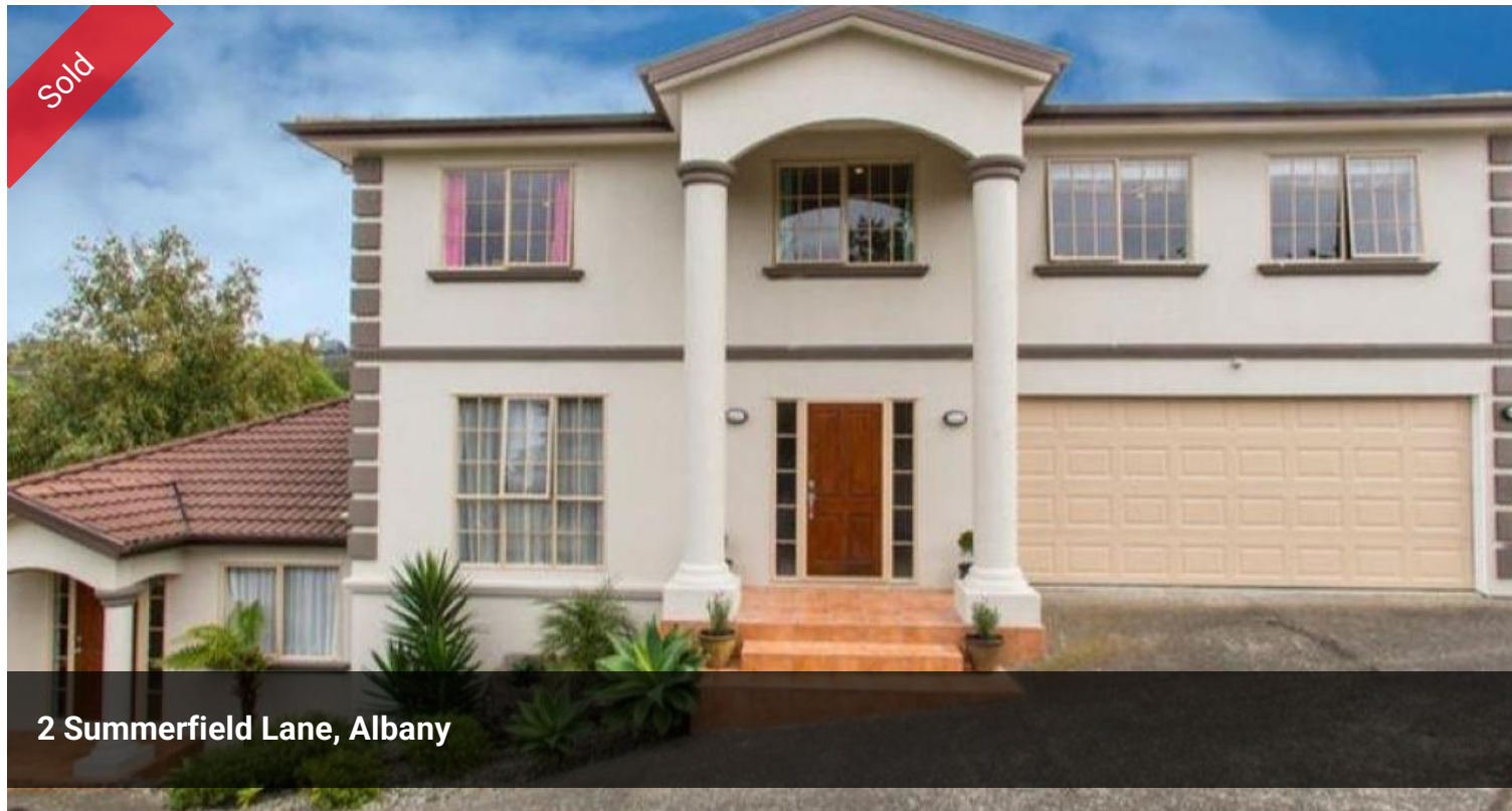
2 Summerfield Lane, Albany