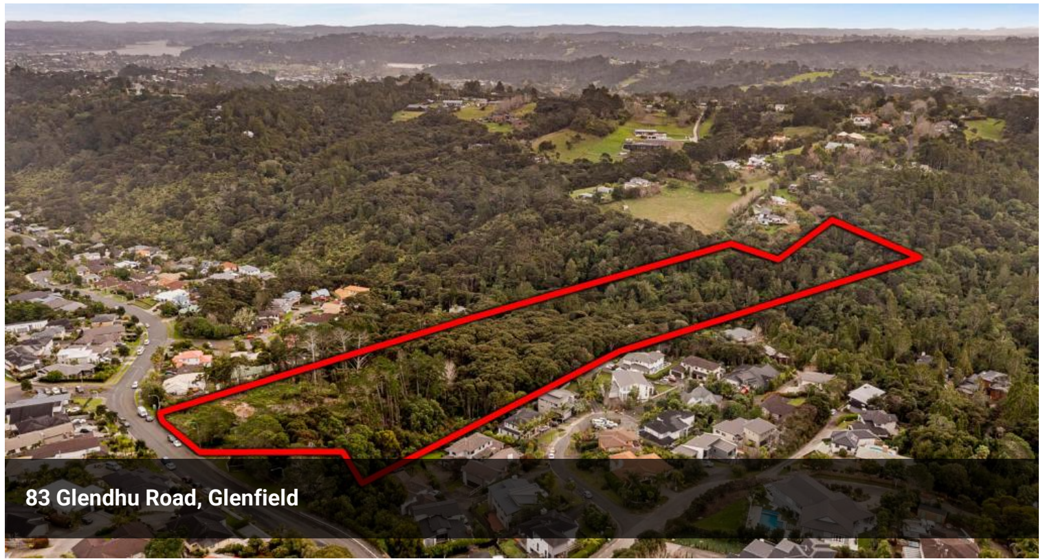
83 Glendhu Road, Glenfield