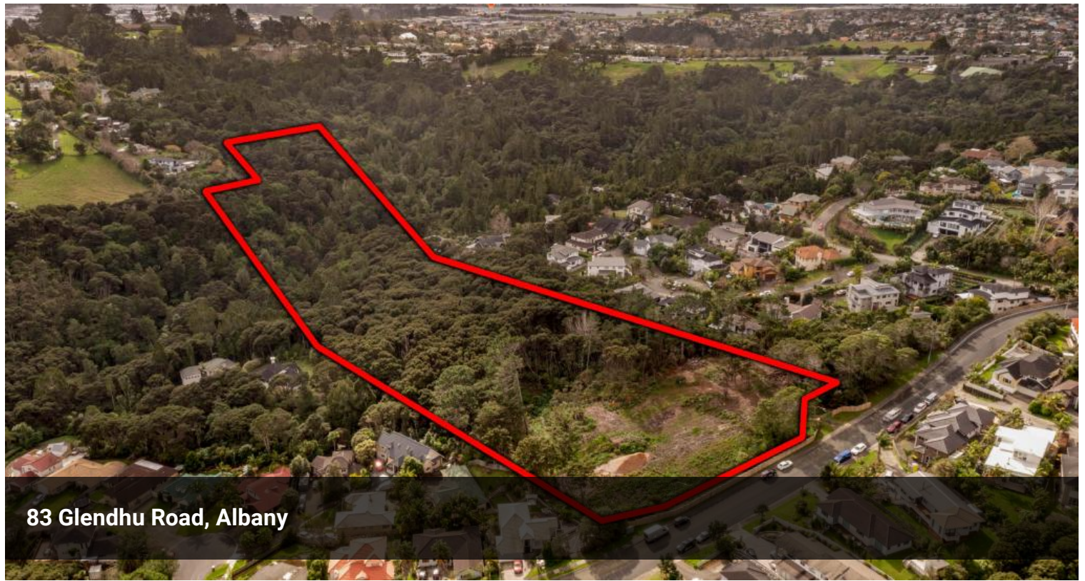
83 Glendhu Road, Albany