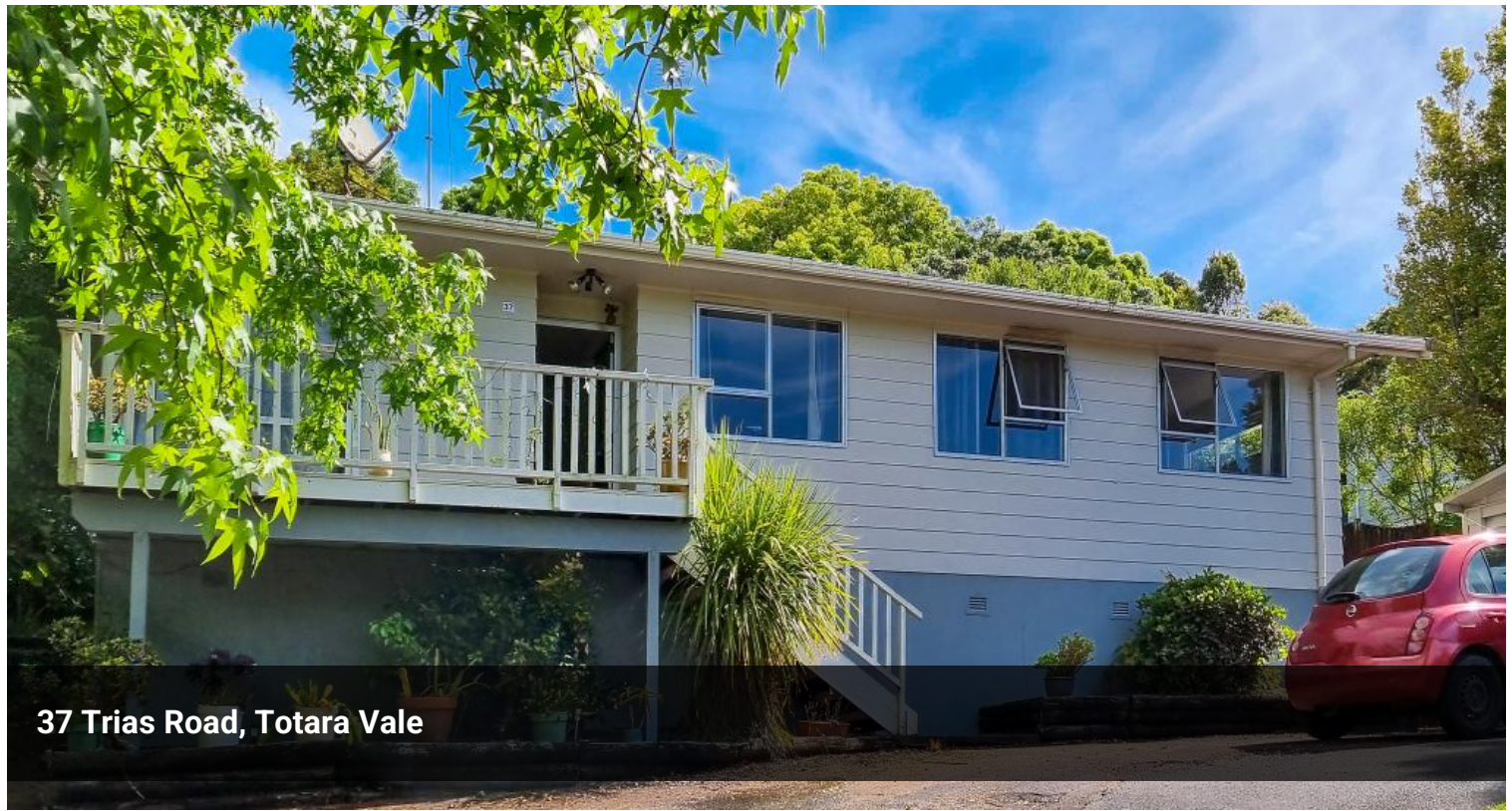
37 Trias Road, Totara Vale