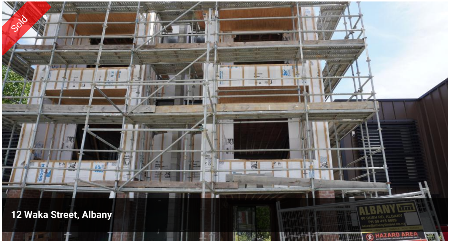
12 Waka Street, Albany